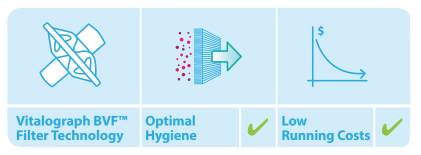
Advantages of Vitalograph Filter Technology

Optimal Protection During Spirometry. Cardboard mouthpieces and disposable turbines do not prevent germ carrying droplets from passing through the device into the testing environment. Our BVF provides that optimal protection with 99.999% cross infection protection against bacteria and viruses including COVID-19, Influenza, TB, MRSA, etc.